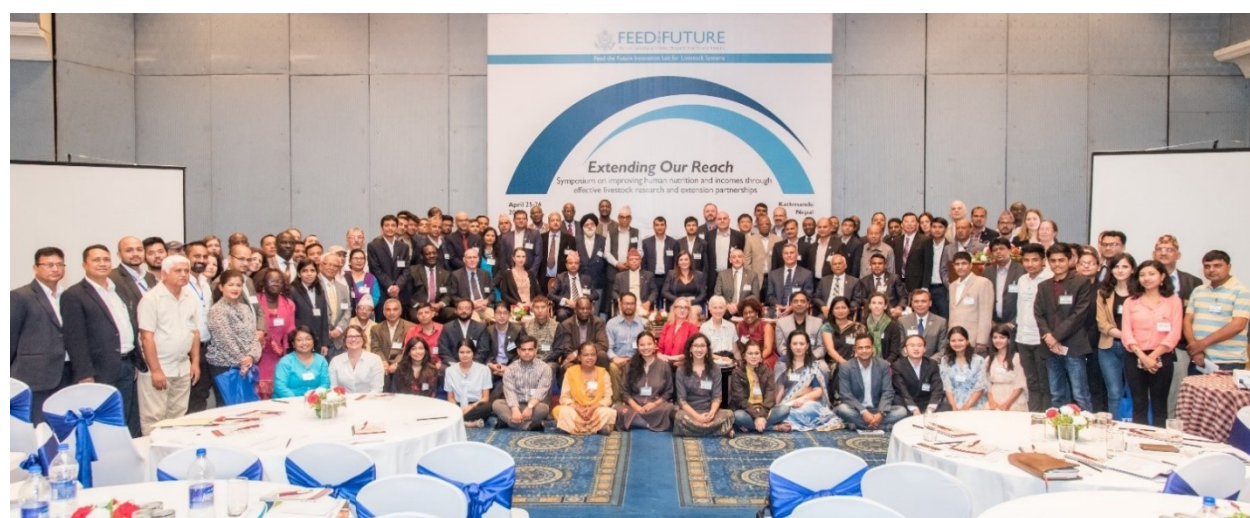
Our Global Symposium united more than 160 participants from 14 countries in Kathmandu, Nepal.