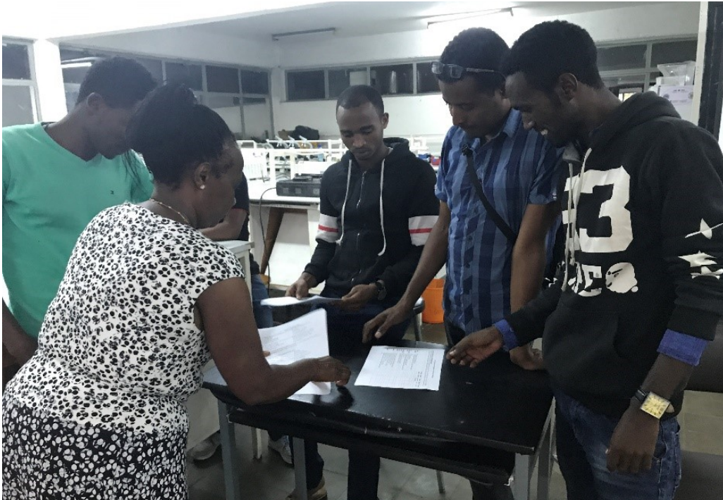
Students at Hawassa University, Ethiopia, prepare to survey families about their nutrition and eating habits.

To assess the current knowledge about meat contamination in Ethiopia, a group of six researchers from the U.S. and Ethiopia scoured scientific studies from 2008 to 2018. Reviewing evidence from 7,828 meat samples, the researchers found high levels of contamination, and they recommend new interventions to address meat safety. The findings are available in the scientific article on The prevalence and antimicrobial resistance profiles of bacterial isolates from meat and meat products in Ethiopia: A systematic review and meta-analysis , published in January 2019 in the International Journal of Food Contamination (visit https://doi.org/10.1186/s40550-019-0071-z ). This research was funded through our project on Linking Cattle Nutrition to Human Nutrition, and a principal investigator, Dr. Jessie Vipham from Kansas State University, is a co-author.