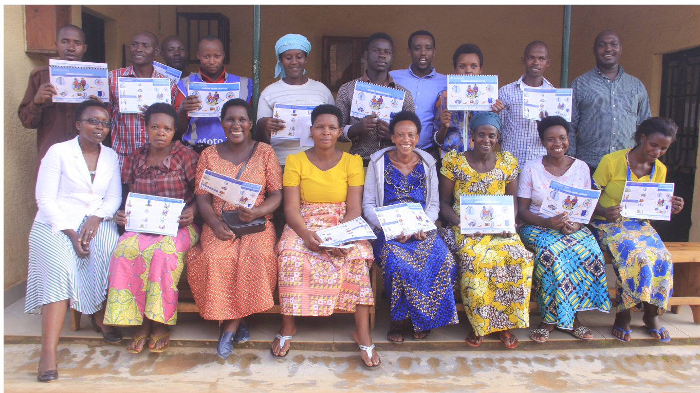
Workshop participants in Kagugu, Rwanda, hold the posters they will use to teach others about the importance of milk in the diet.