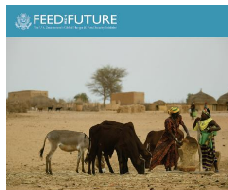
Feed the Future Innovation Lab for Livestock Systems