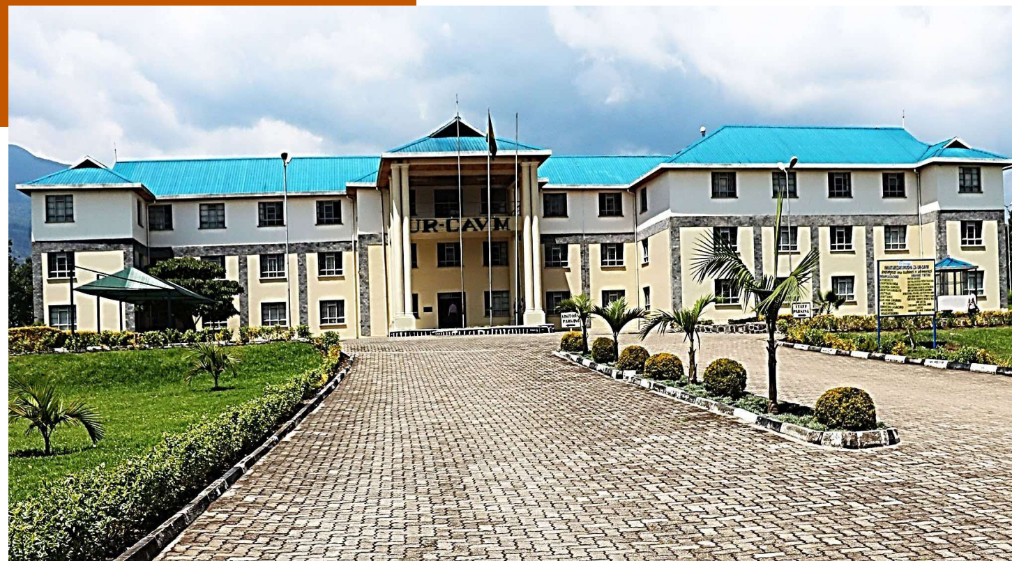
Main building for the College of Agriculture and Veterinary Medicine, University of Rwanda