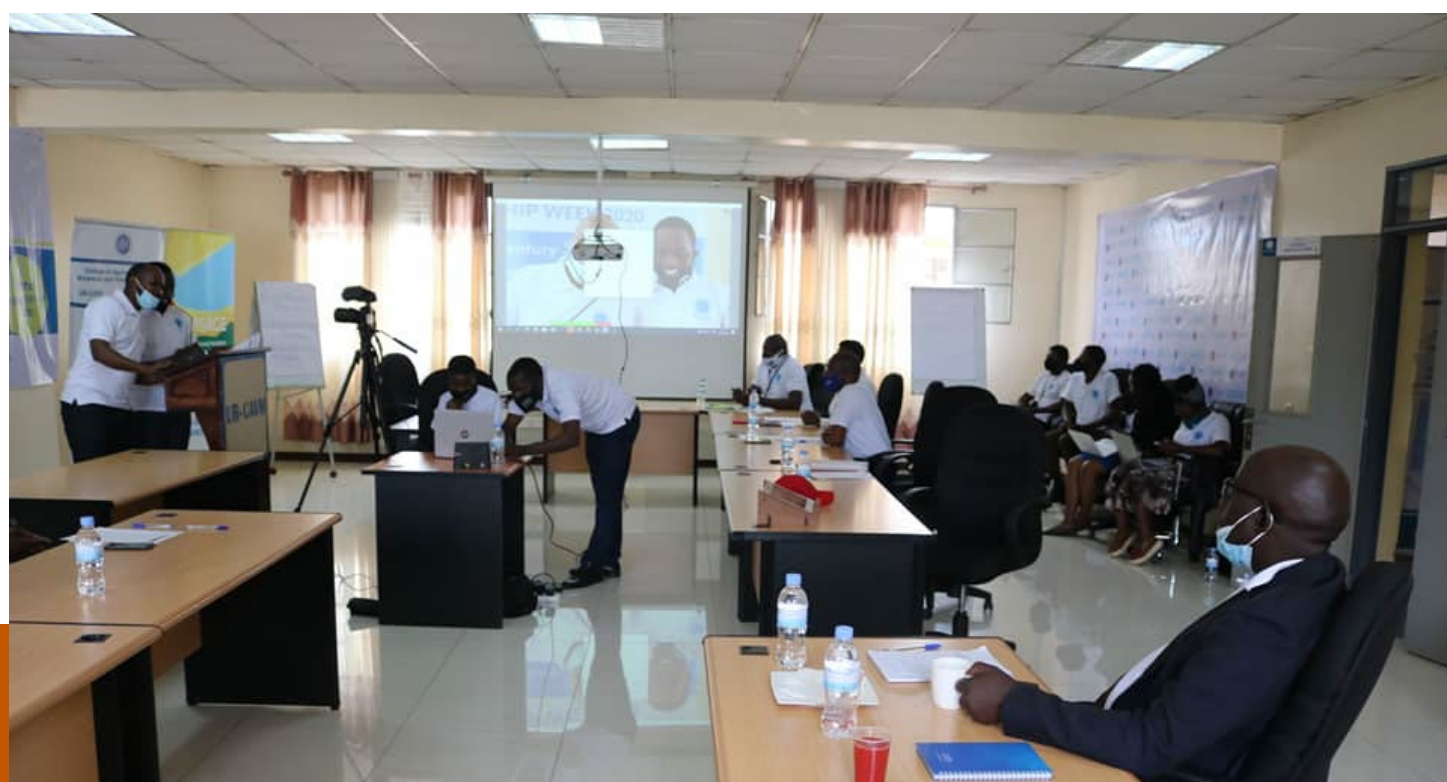
UR-CAVM Academic staffs listening to students' presentations during the UR Entrepreneurship week