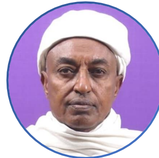
Tumul Orto Galdibe Livestock Keeper, Northern Climate Resilience Initiatives