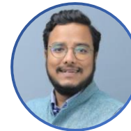
Sukirti Vinayak Hybrid livestock insurance (PULA)