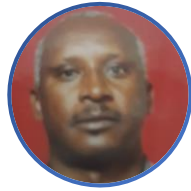
Guyo T. Dabelo Market based livestock offtake (Comnoor Investment)