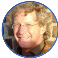
Chip Stem Carbon-neutral livestock fattening and finishing (LTS)