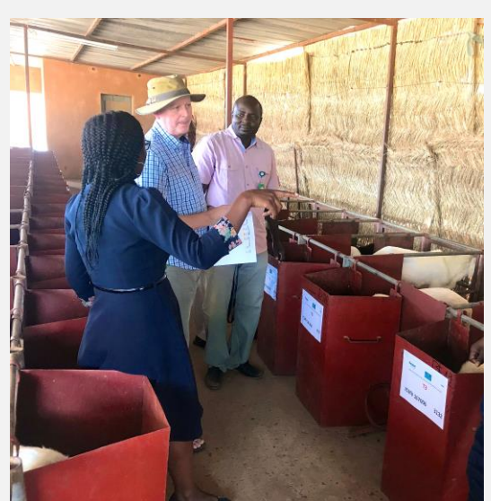
Picture 2. Feeding experiment of sheep fed with stover of different millet varieties