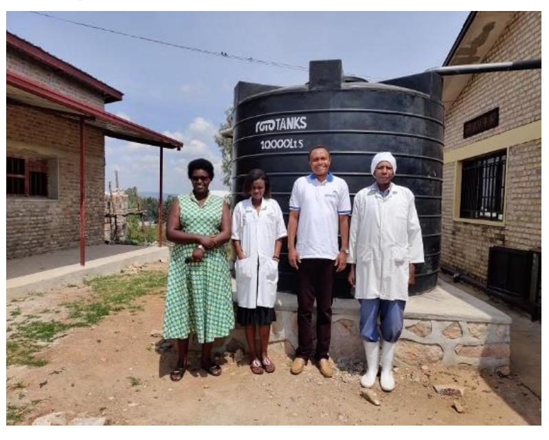
Figure 2: Water tank at Koperative Amizero y'Aborozi.

On the basis of the assessment and separate discussions with the Board of Directors of both COOPEKA Kayenzi and Koperative Amizero y'Aborozi, it was decided that water tanks would mitigate the water shortages and milk quality challenges faced by the POs. These two POs rely fully on rainwater as they do not have access to piped water for the coolers and to clean cans and premises. Lack of hygiene was affecting milk quality. As in-kind support, TechnoServe provided each of the POs with a tank (10,000 liter capacity) and the POs constructed the base of the tanks. This contribution conveyed a sense of ownership. Ready access to clean water is expected to improve milk quality and hence allow the POs to benefit from premium prices from processors.