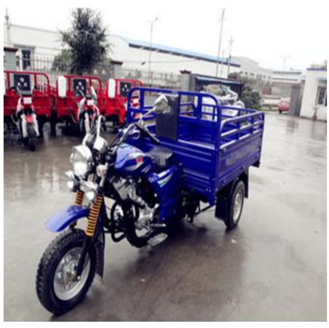
Figure 3: Cargo Tricycle for CEMO PO.

As a result of the assessment and discussions with the Board of the Cooperative des Eleveurs Moderne (CEMO), an initiative geared at utilization of a satellite center in the PO catchment area was developed. Utilization of the satellite center would increase milk quantity and quality as well as access to business development services. The satellite center would lead to an increase in milk quality by reducing the time farmers take to deliver it to the PO for chilling. Initially, the PO needed support in the construction of a milk collection point in the satellite center, but after a long period of time waiting for land allocation by district officials, we were told that it was not possible. The project held a series of meetings with the Board, which then opted for a cargo tricycle. This was paid for by TechnoServe; CEMO's ownership stake was to transport it from Kikali to its premises in Nyabihu District. The cargo tricycle is being used to transport milk from the satellite center either to the PO for chilling or directly to the processor.