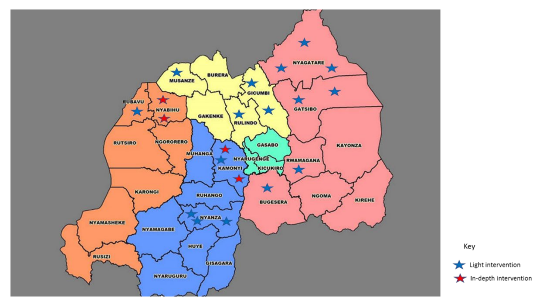
Figure 1: Location of the dairy cooperatives undergoing capacity development interventions